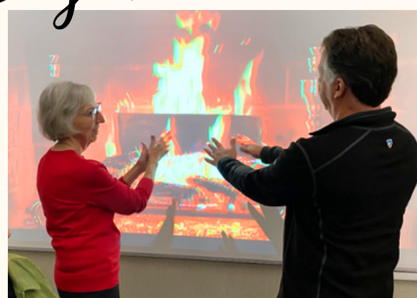
The Board warming up by the cozy, Smart Board fire!